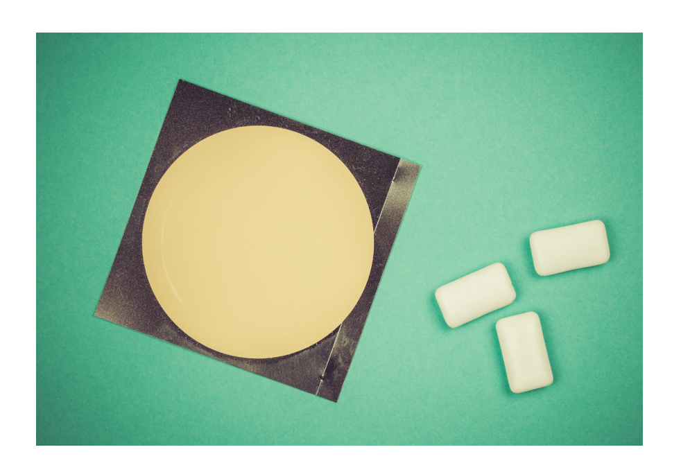
Nicotine patch and gum